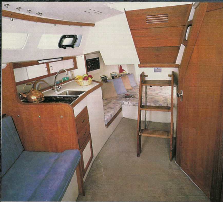
The main cabin, view aft. The aft berth has a port overhead for light and ventilation, via the cockpit