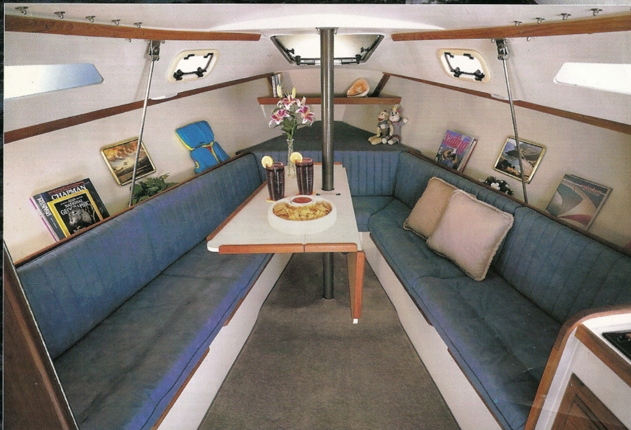
The main cabin, view forward. The drop leaf table accomodates six for me